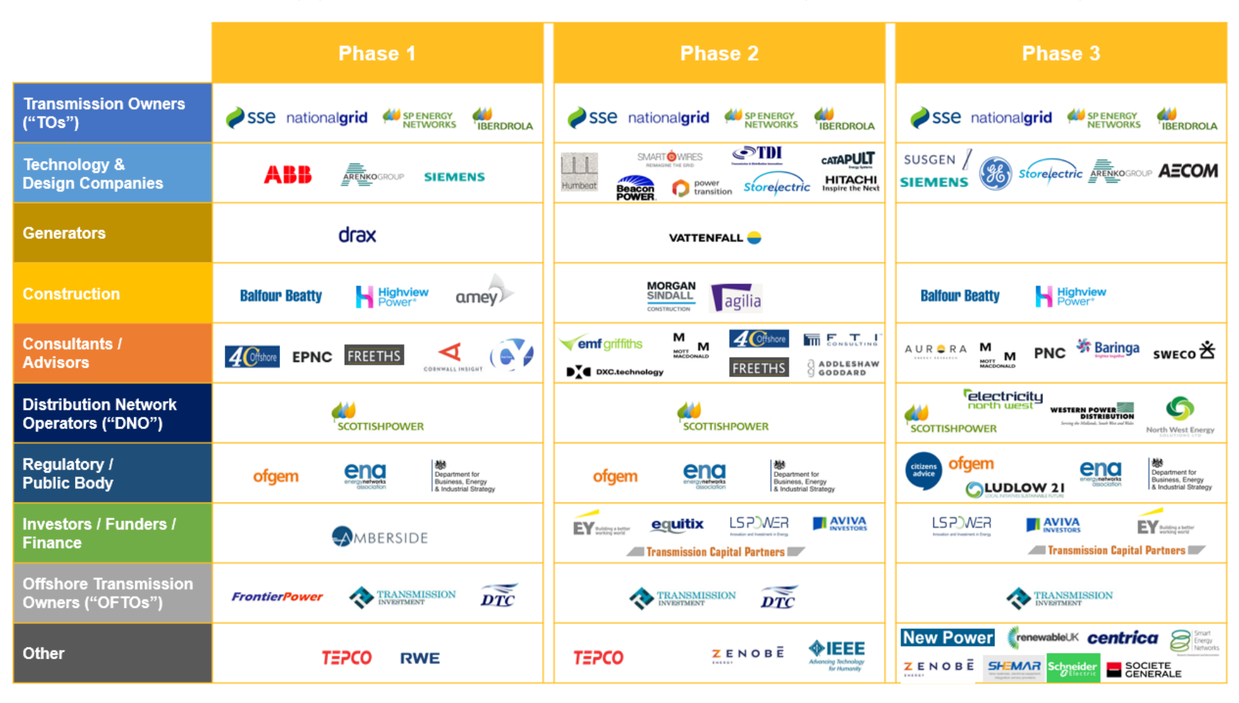
Table 1: Who we have engaged with

Table 1 presents who we have engaged with at each phase in the development of the ECP categorised into different stakeholder groups.