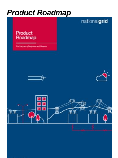
This document sets out the actions to be taken forward for frequency response and reserve.