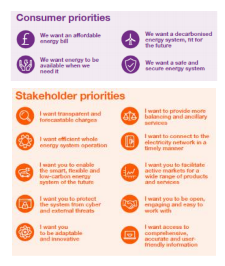
Figure 5: Consumer and stakeholder priorities – taken from ESO Business Plan

Through engagement with stakeholders and consumers, the ESO have defined a set of consumer and stakeholder priorities which are used to guide proposals and assess how the activities will deliver value: