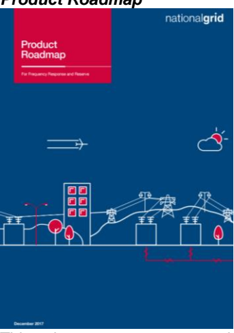
This document sets out the actions to be taken forward for frequency response and reserve.