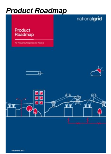
This document sets out the actions to be taken forward for frequency response and reserve.