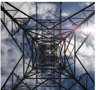
"Affordable and secure energy are our highest priority"